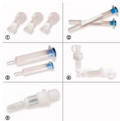
Empty columns for protein isolation