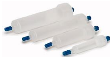
Empty cartridges FPLC