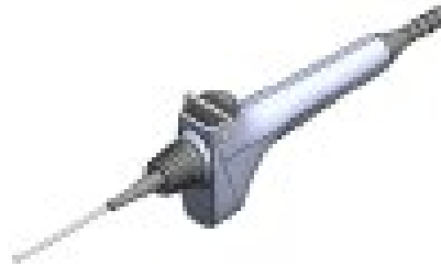
Position 2, 30% increase in liquid absorption rate