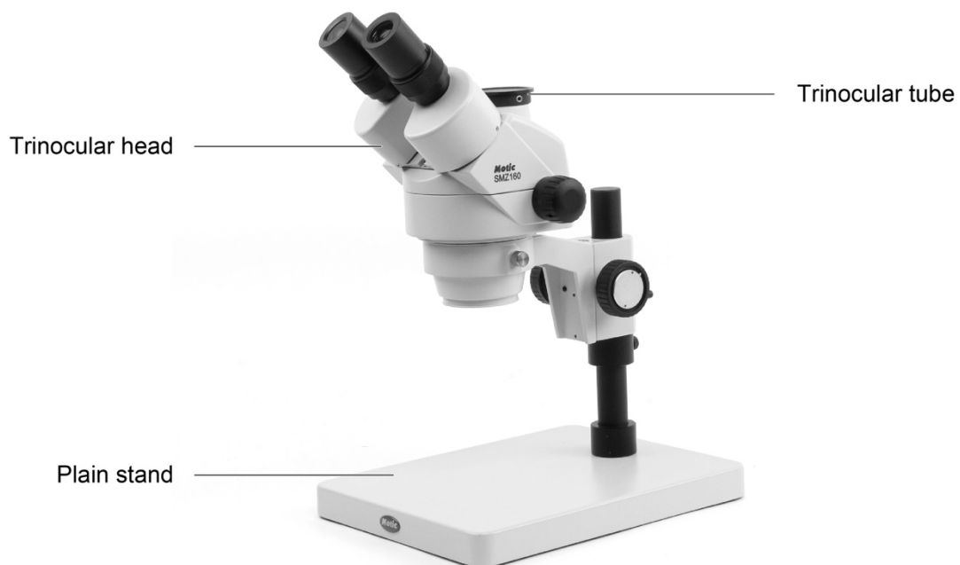
SMZ160 TP (Fig.2)