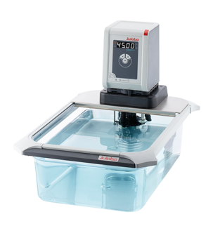
CORIO CD circulator for bath tanks up to 50 l.