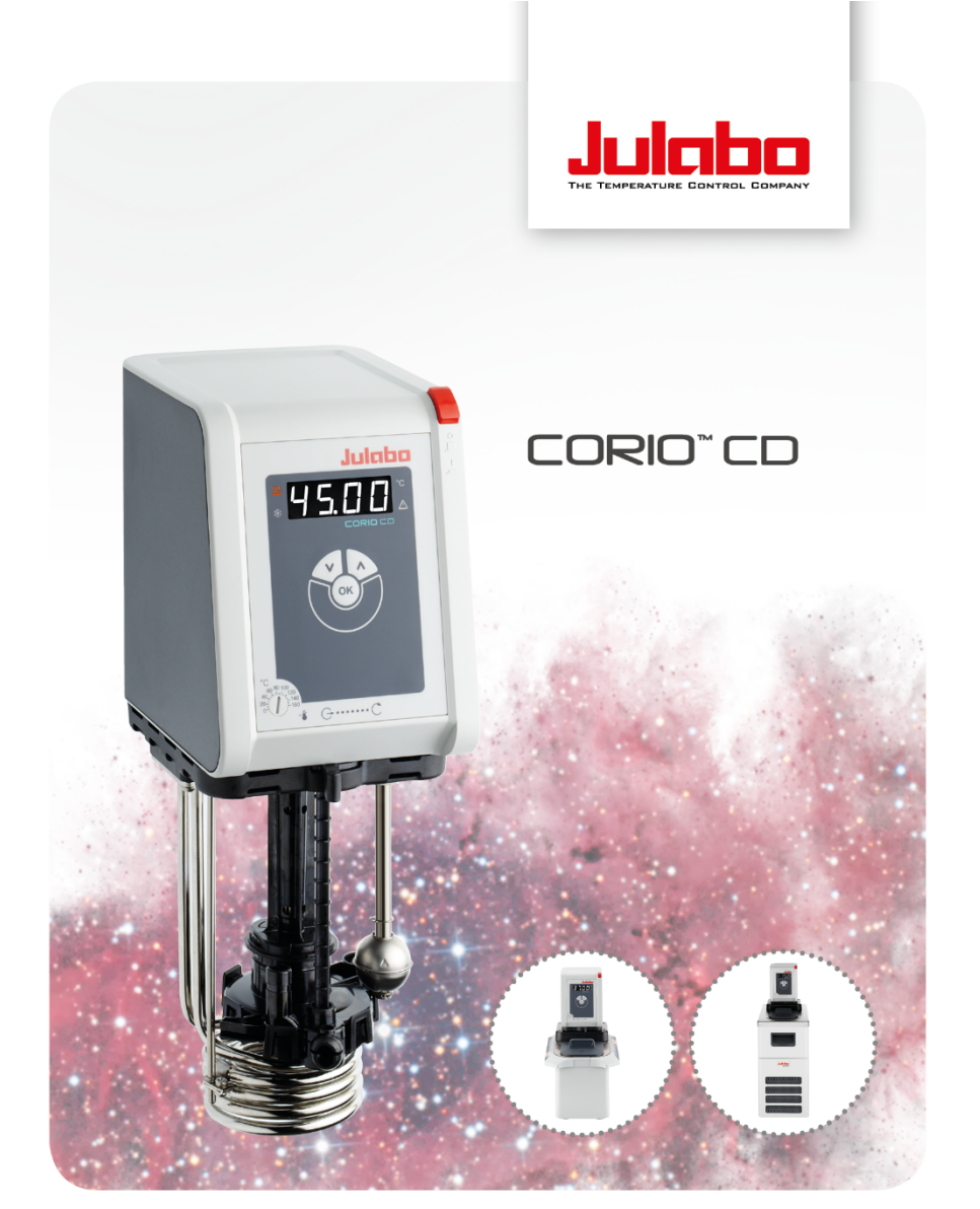
Heating immersion circulator, open bath heating circulator, refrigerated circulator