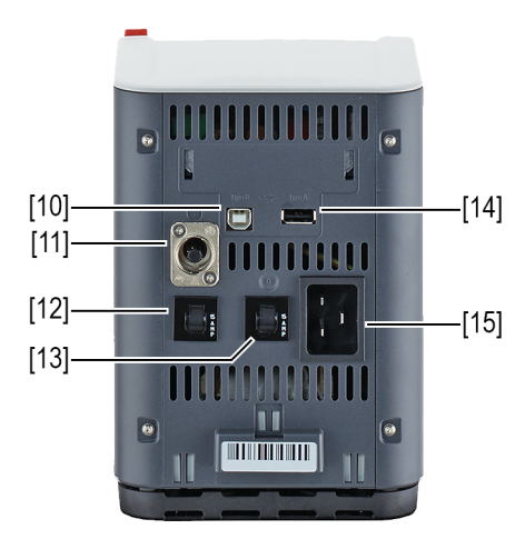
Fig. 1: Control and function elements