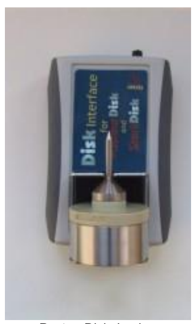
PasteurDisk Jumbo, SterilDisk Jumbo

Note: some interfaces, for special purposes (for example, when a logger is connected to a dummy unit of product and should not be taken away from it and so cannot be placed in the Disk Interface or in its adapter), might have a cable with two clips, red and black. The red one must be connected to the probe or to the end where the probe would have been, if you have the version without the probe, while the black one should be connected to the other end. If you misplace the two clips the interface simply won't be able to communicate with the logger. If you get an error message, just invert the two clips on the two ends of the logger.