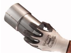
HyFlex®-cut resistant gloves Art. No. XY04.1–XY07.1