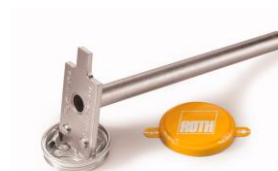
Tri-Sure®-barrel and keg key Art. No. 0398.1

Note: For protection against injuries because of sharp-edged metal please wear protective gloves and follow the instructions on the label of your product as well as in the safety data sheet.