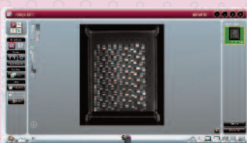
Image editing offers full control of enhancements, annotations and documentation

Live preview and manual lens adjustment make achieving optimal settings quick and efficient