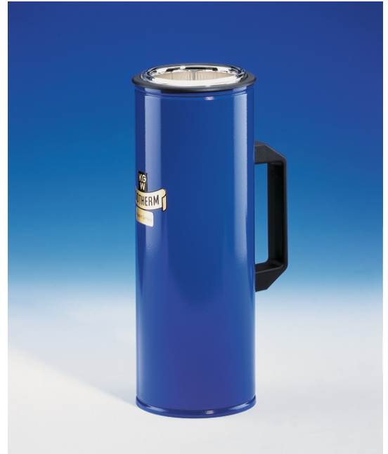
Dewar flask G 9 C